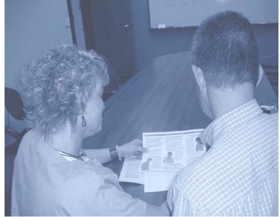
The Disease Intervention Specialist counsels a patient about community social service support.

The DIS works to contact and communicate with infected patients, partners, and spouses that are diagnosed with syphilis and/or HIV/AIDS, preserving confidentiality and privacy of all involved. Part of this process includes counseling face-to-face in a private setting without revealing the name of the original patient to the partner. The DIS also assists in identifying the patient's needs and connects the patient to the appropriate care.